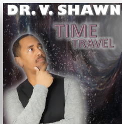
Time Travel Genre: House 10 Original Tracks Released: 2017