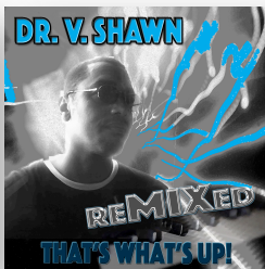
That's What's Up Remixed Genre: House 8 remixed originals Released: 2014